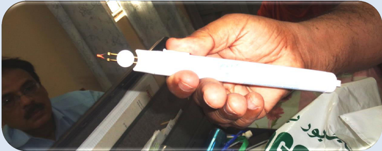
Red hot forks visible in cosmetic surgical equipment used for removal of warts