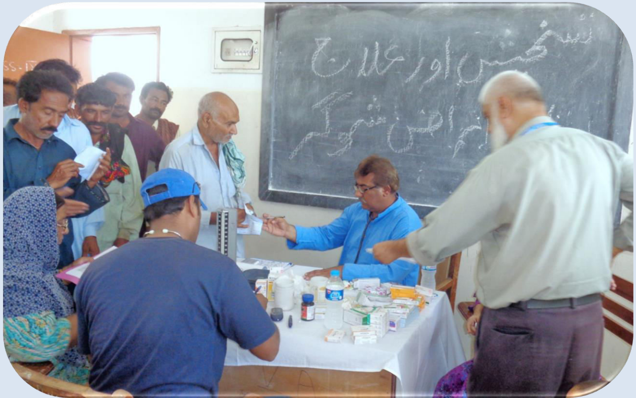
Around 500 male and female patients of Sugar and Blood Pressure visited this OP