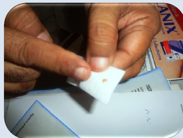
Warts residuals removed from different patients (Minor Cosmetic Surgery)