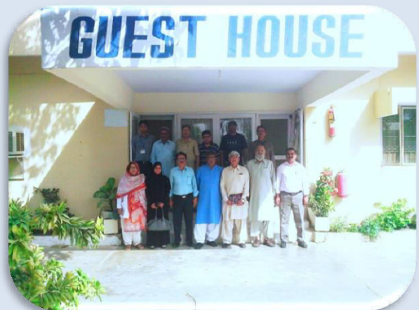
Hospitality is TCCL's inveterate tradition. Delicious lunch was arranged at Guest House