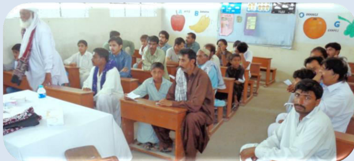
Male and Female Patients visited Medical Camp are waiting for their appointments