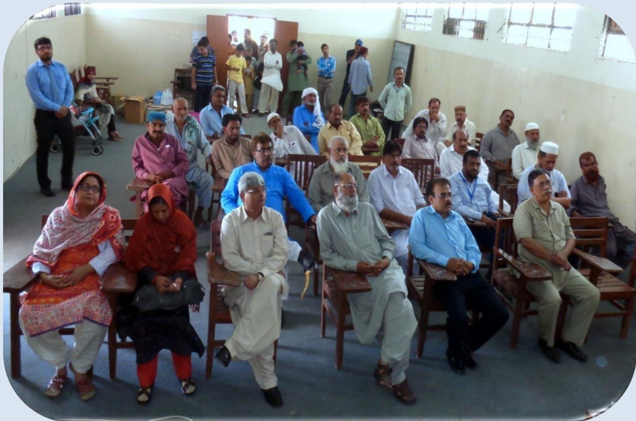
WADeP Doctors and Para Medical Staff, Thatta Medical Center Staff, HSE Staff, Admin Staff and other TCCL employees are visible in audience of Medical Camp opening ceremony (Auditorium of Model Terbiat School, Thatta Cement Officer Colony)