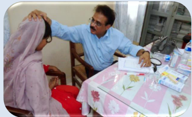
Female OPD # 2: MTS Vice Principle Office was reserved to facilitate female patients