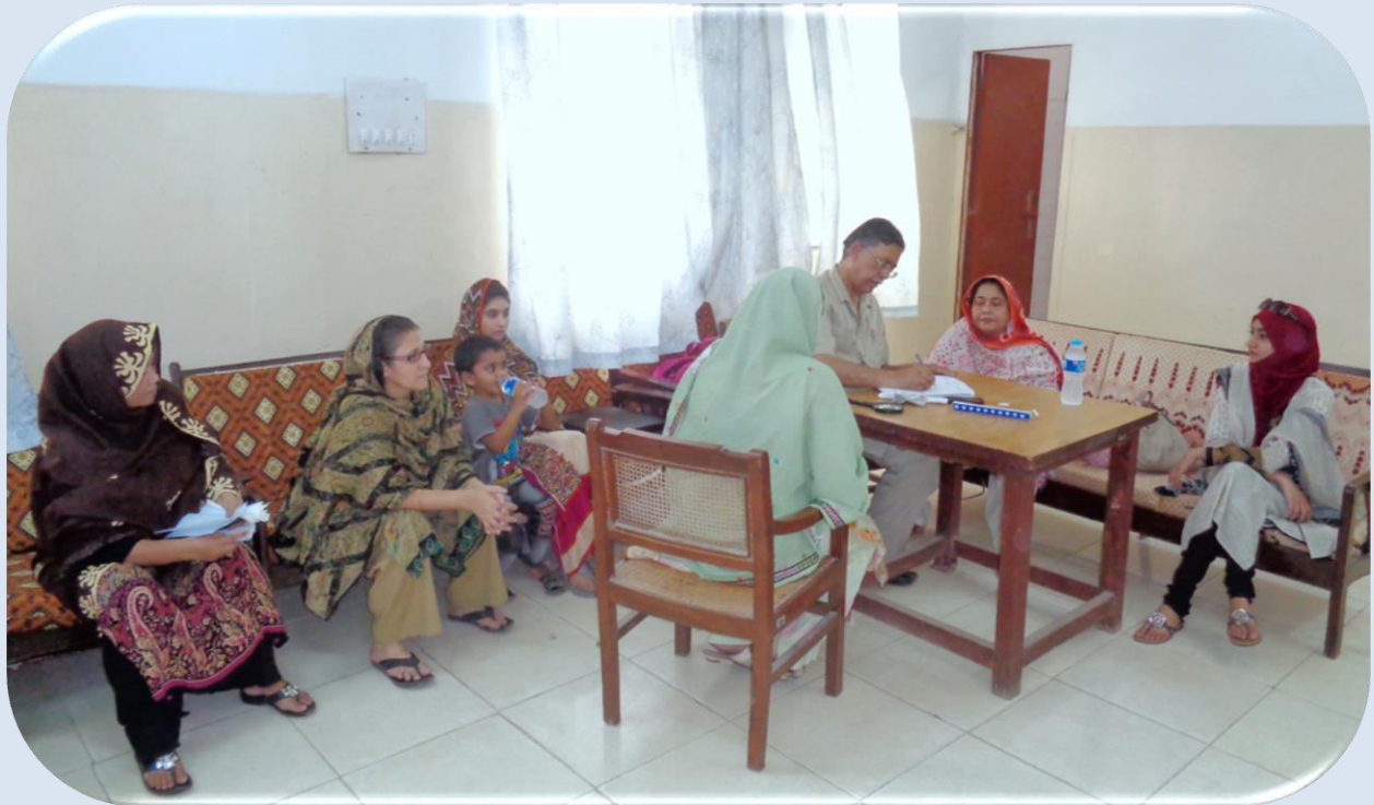
MTS Staff Room was reserved for Female OPD # 1 (Skin, Hair and Nail Diseases Checkup)