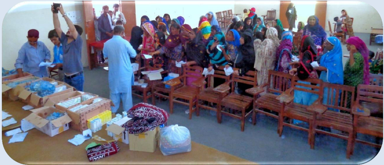
Free medicines distribution compound for female patients