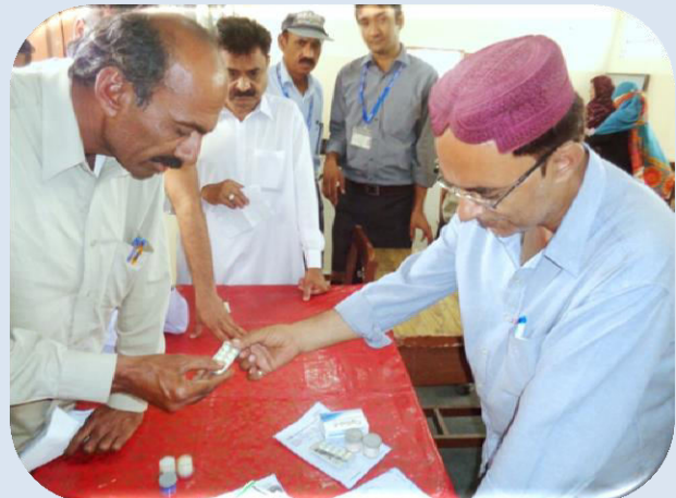
Free medicines distribution corner for male patients