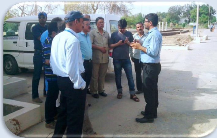
Industrial visit of WADeP Team at TCCL Plant