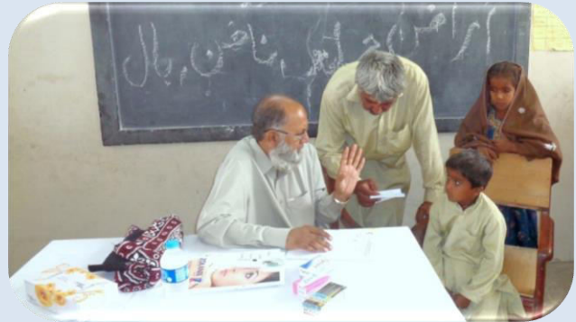
Medical Checkup and Consultancy on skin, hair, nail related diseases provided to patients