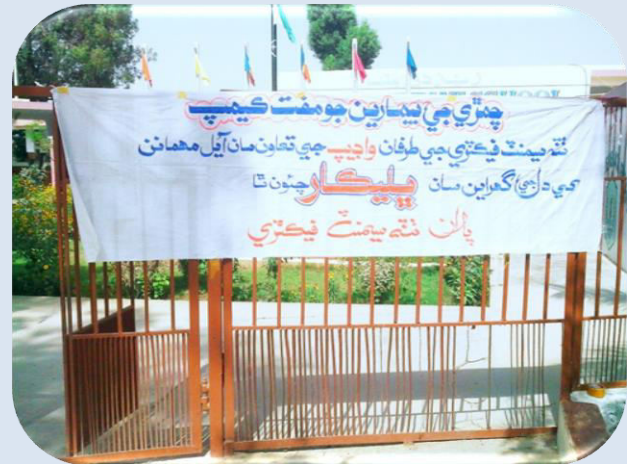
Main entrance of Medical Camp decorated with Welcome banners to facilitate the visitors