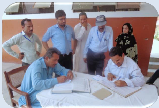
Patients registration counters managed by Thatta Medical Center Staff