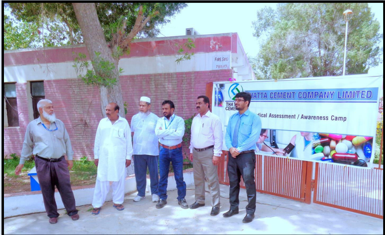
TCCL Employees are ready to welcome the WADeP Doctors Team from Karachi